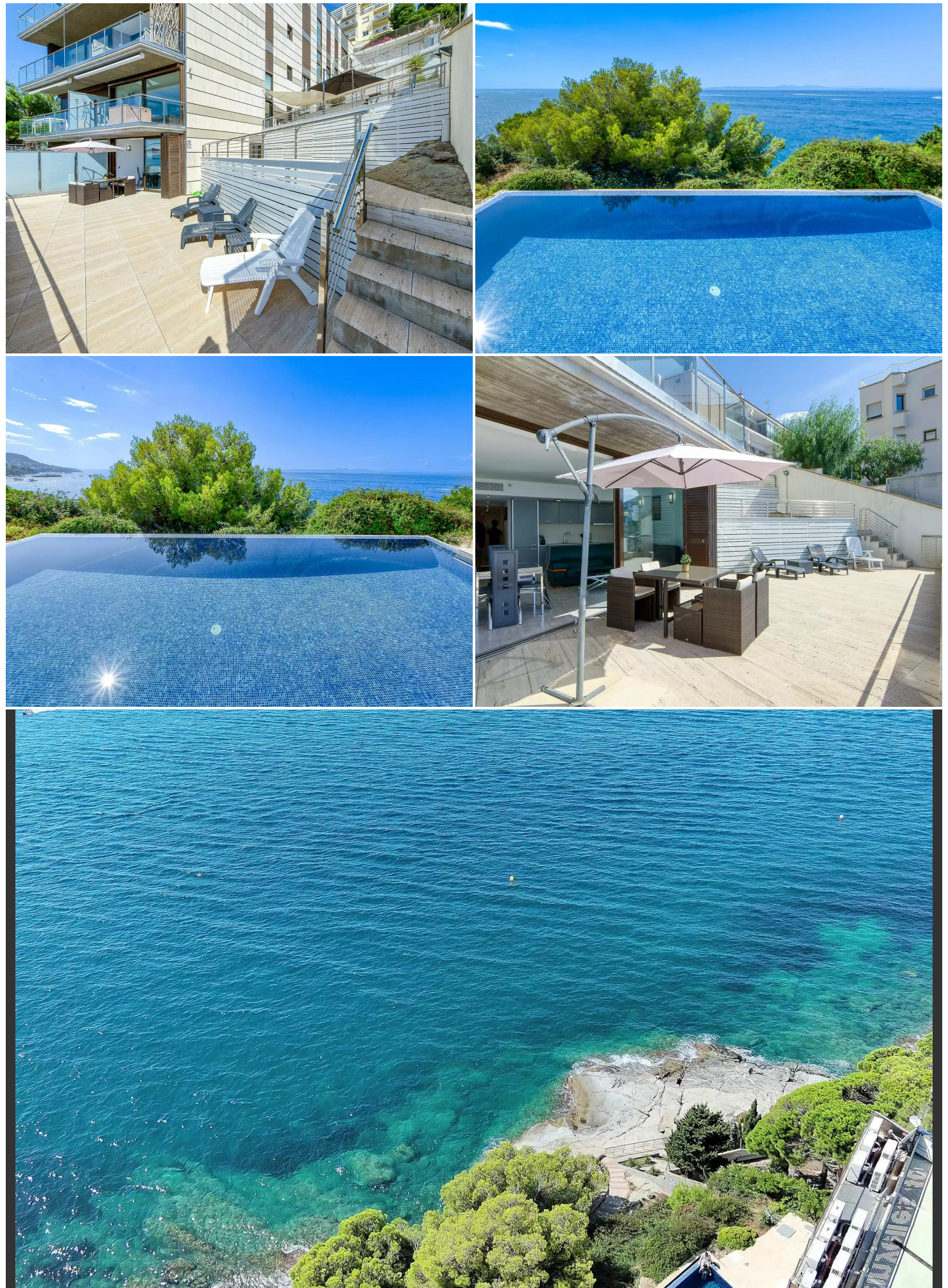
Belle Property, Avda Joan Carles I, 10 Local 2, 17487 Empuriabrava - Girona