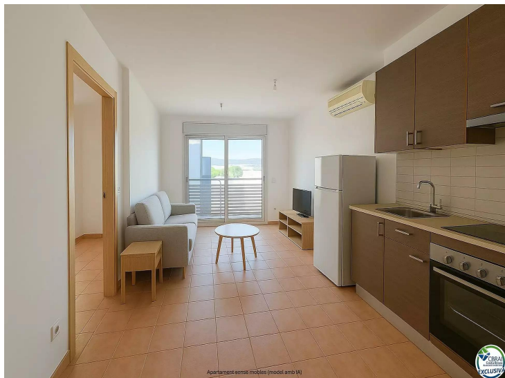
Apartament sense mobles (model amb VA)