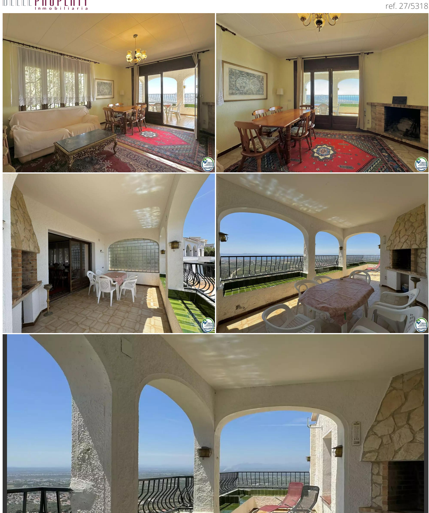
Belle Property, Avda Joan Carles I, 10 Local 2, 17487 Empuriabrava - Girona